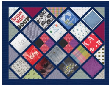
On point block